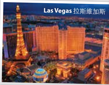
Las Vegas 拉斯維加斯

經停[西部牛仔古鎮]，前往夜夜笙歌、越夜越美麗的賭城-拉斯維加斯。賭城的夜景五彩霓虹，尖端科技的特效噱頭令人讚嘆神奇。參加燦爛經典的[夜遊*]，不論是金殿的人造火山爆發，還是凱撒宮的雕像秀，令您飽覽無疑。賭城中最神秘的百樂宮、迷人的芭蕾舞、舊城的大型天幕秀，精彩刺激，五彩繽紛的街景盡入眼簾。