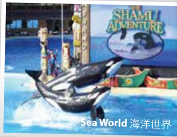
Sea World 海洋世界

洛杉磯深度遊或自費遊覽洛杉磯迪士尼樂園/加州冒險世界(門票USD$94起) Your Los Angeles sightseeing include Little Saigon , the largest Vietnamese community outside Vietnam, Rodeo Drive , the most famous shopping street in Hollywood, Los Angeles downtown area including old Chinatown & Disney Concert Hall and Citadel Outlet , the largest shopping outlet in LA. [洛杉磯深度遊]包括越南華僑很集中的[小西貢]，品嚐地道越南美食。或自費遊覽世界上最歡樂的地方-[迪士尼樂園]。或自費遊覽[加州冒險世界]。