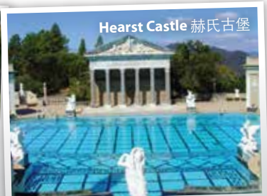
Hearst Castle 赫氏古堡