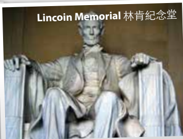
Lincoln Memorial 林肯紀念堂