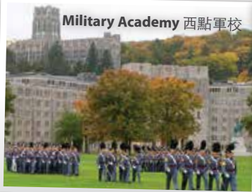
Military Academy 西點軍校

Head to the United States Military Academy* (subject to change) at West Point. The academy sits on scenic high ground overlooking the Hudson River and the entire central campus is a national landmark. It has produced numerous successful graduates among its more than 50,000 alumni, including Presidents Ulysses S. Grant, Generals Lee, Patton, etc. Continue to Woodbury Common Premium Outlets . Featuring 220 outlet stores with famous labels such as Giorgio Armani, Burberry, Jimmy Choo and Yves Saint Laurent at discounted prices, you will have the opportunity to purchase brand names up to 65% off. In the evening have free time in Time Square and enjoy a New York night view. 參觀美國將軍的搖籃:[西點軍校*](視情況而定)。名將格蘭特、艾森豪威爾、巴頓等均是該校的畢業生。前往全美最大、最新的[奧特萊斯名牌購物商場]，有220多間世界名牌商店，Gucci、Fendi、Armani、Polo、Prada等，平均超過五折。之後夜遊欣賞時代廣場、曼哈頓夜景。