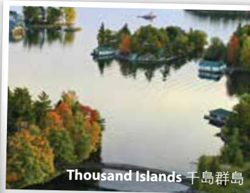
Thousand Islands 千島群島

Your highlight today is a cruise aboard the Maid of the Mist* (seasonal), which takes you through the churning waters part the American and Bridal Veil Falls and into the mist of the spray inside the curve of Horseshoe Falls. Watch IMAX movie* and learn Niagara Falls' incredible stories and to take the elevator to the observation deck of Skylon Tower* offering the very best views of Niagara Falls. Travel on to the cosmopolitan Toronto. Visit Canadian National Tower* , Toronto's most recognizable landmark and the tallest building in Canada. At the top of the tower, enjoy panoramic views through glass floor observation decks and see why this structure was recently nominated one of the Seven Wonders of the Modern World. Visit Toronto Chinatown , one of the largest Chinatowns in North America. 前往欣賞尼加拉瓜瀑布，是由馬蹄瀑布、美國瀑布及新娘面紗瀑布所合成。夏天搭乘著名的[霧中少女「號遊船*」(季節性)穿梭於波濤起伏的瀑布間，水花迎面撲來，刺激緊張。看[IMAX電影*]了解尼加拉瓜瀑布的歷史。參觀[摩天塔*]，在觀景台觀看氣勢磅礴之世界大瀑布，景觀格外特別。下午抵達加拿大第一大城及金融中心-多倫多，參觀[加拿大國家塔*]，搭乘高速的玻璃電梯上塔頂，可遠望尼加拉瀑布的霧氣全景。走上玻璃地板的太空甲板，挑戰自我。於北美第三大唐人街自由用晚餐。