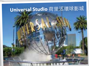
Universal Studio 荷里活環球影城