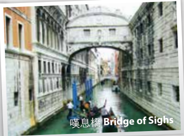
嘆息橋 Bridge of Sighs