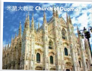
米蘭大教堂 Church of Duomo

Admire the sights of Milan during your morning short orientation tour, including La Scala and Church of Duomo .