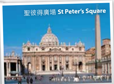
聖彼得廣場 St Peter's Square