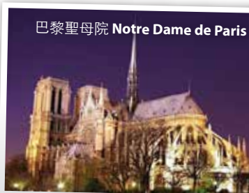
巴黎聖母院 Notre Dame de Paris

前往巴黎觀賞各大名：[巴黎聖母院]、[羅浮宮]、[馬德萊娜教堂]、[凱旋門]和[埃菲爾鐵塔]等，登上[蒙帕納斯大樓56層觀景廊]及[乘觀光船漫遊塞納河兩岸]。Drive to Paris. Visit Notre Dame Cathedral , Louvre , La Madeleine , Arc De Triomphe , Eiffel Tower etc. Visit the world-famous 56 floored Montparnasse Tower .