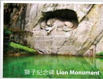
獅子紀念碑 Lion Monument

In the afternoon visit Mount Titlis in Swiss Alps. Then drive to the picturesque lakeside town of Lucerne. A short orientation tour includes Lucerne's emotive Lion Monument and the covered Chapel Bridge . You will also have time to shop for Swiss specialties .