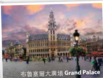
布魯塞爾大廣場 Grand Palace