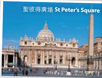
聖彼得廣場 St Peter's Square

前往天主聖地教皇國、世界小的獨立國-梵蒂岡觀光，參觀幾百年的積累財富和迷人的[西斯廷教堂]。之後參觀世界上最大的[聖彼得大教堂]和宏偉的[聖彼得廣場]。然後渡河到意大利首都、世界著名的歷史文化名城-羅馬，遊覽羅馬古蹟中最著名的[羅馬鬥獸場]、[許願泉]和[西班牙階梯]。Begin today's sightseeing at the World's smallest state, the Vatican City . See the centuries of accumulated wealth and the breathtaking Sistine Chapel. Enter St Peter's Basilica , the largest church in the world and emerge into St Peter's Square . Then cross the River Tiber into ancient Rome to the Forum and the mighty Colosseum . Visit the incredible Trevi Fountain and Spanish Steps .