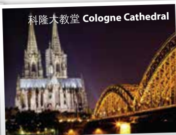
科隆大教堂 Cologne Cathedral