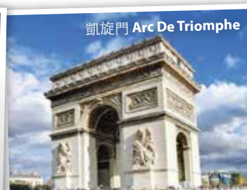
凱旋門 Arc De Triomphe