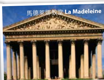
馬德萊娜教堂 La Madeleine