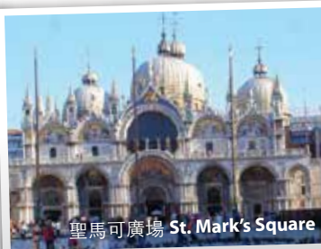
聖馬可廣場 St. Mark's Square