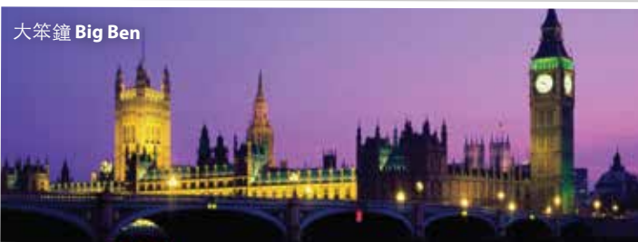
大笨鐘 Big Ben

Welcome to London, the 2012 Olympic City! Enjoy a full day London sightseeing including Big Ben , Trafalgar Square , Buckingham Palace , Westminster Abbey , St Paul Cathedral , Tower Bridge , China Town , Piccadilly Circle , Parliament House etc.