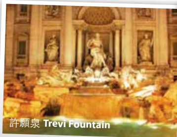
許願泉 Trevi Fountain

Then drive south to Pisa and view the Square of Miracles and the famous Leaning Tower . In the Renaissance city of Florence, enjoy spectacular views of the city from Piazzale Michelangelo. Afterwards there is time to explore the Piazza Signoria , the Duomo , Giotto's Bell Tower and Ponte Vecchio .